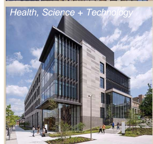
Health, Science + Technology

LU development since the 2012 campus plan