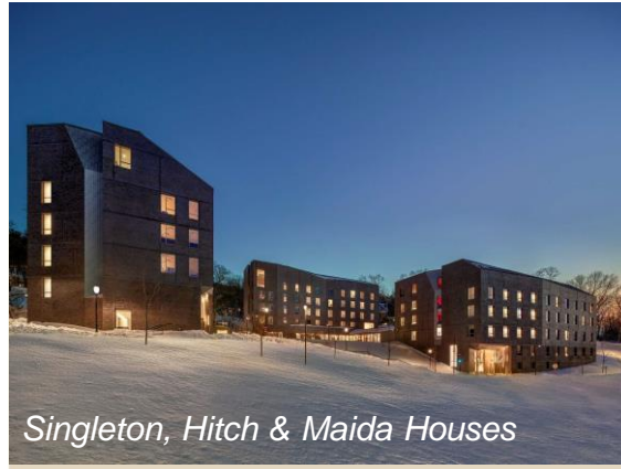
Singleton, Hitch & Maida Houses