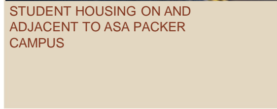
STUDENT HOUSING ON AND ADJACENT TO ASA PACKER CAMPUS