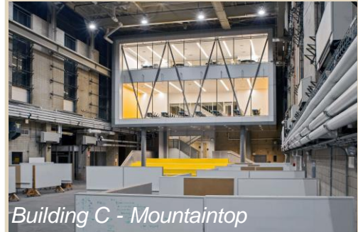
Building C - Mountaintop