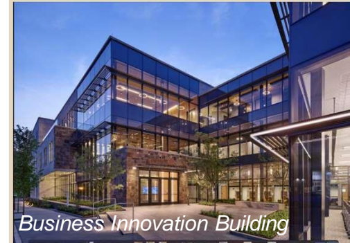
Business Innovation Building