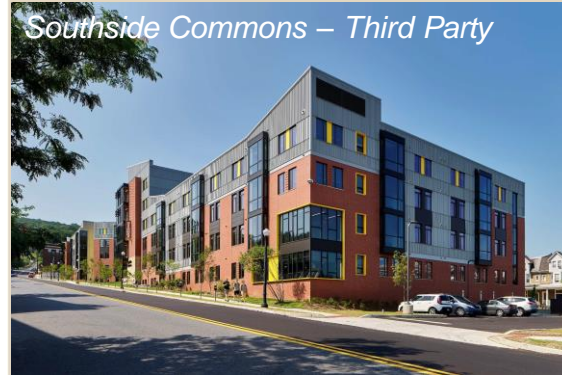
Southside Commons – Third Party