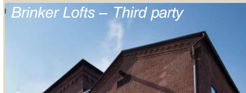
Brinker Lofts – Third party